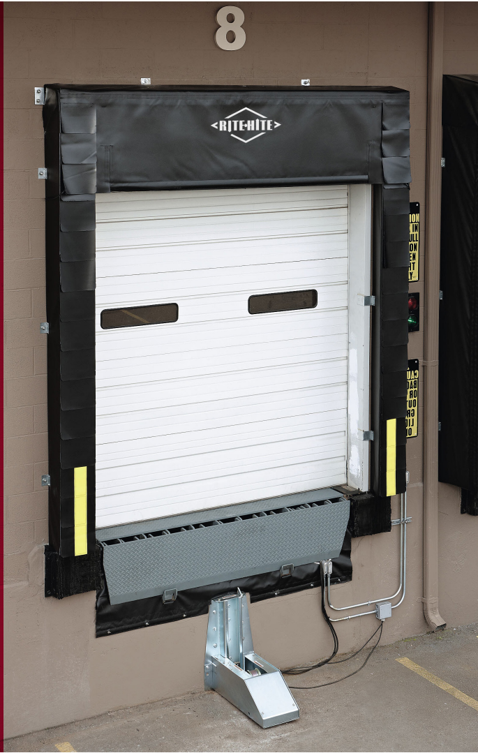
FDSC dock seal with head curtain shown with PitMaster Under-leveler Seal.