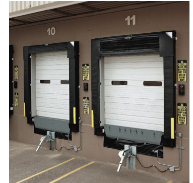
Insulator Dock Seals.