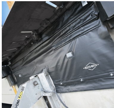
PitMaster Under-leveler Seal.