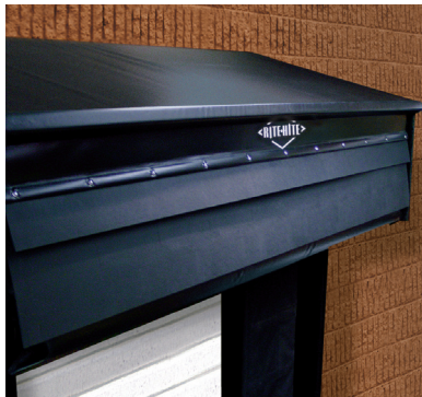
RainGuard Header Seal.