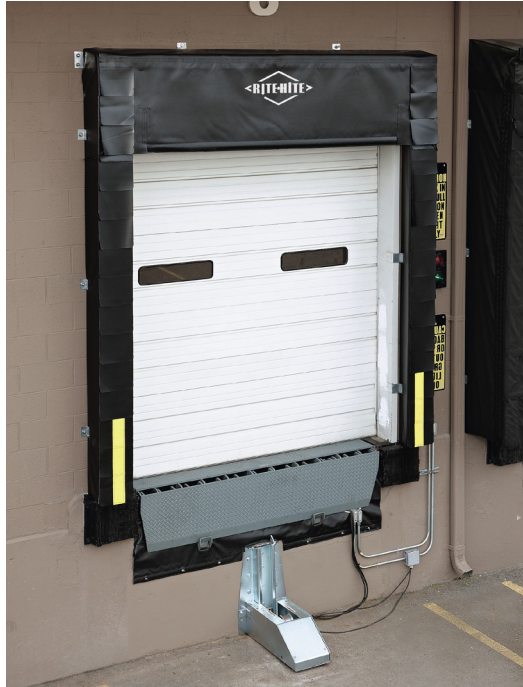
FDSC Dock Seal.