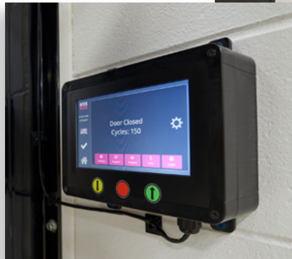
Graphic User Interface (GUI)