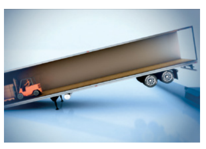
Landing gear collapse.