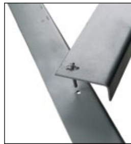
Rear Squaring Support Member