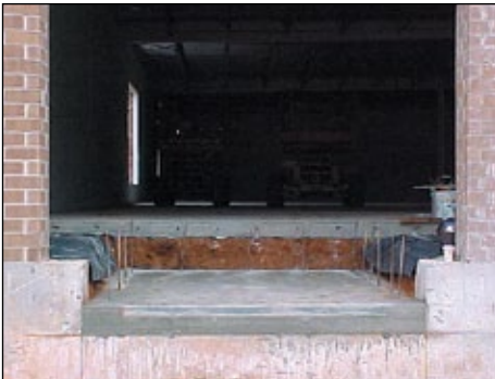
Pour pit floor.