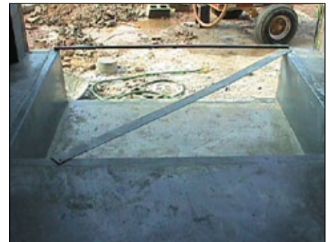
Remove squaring bars - Ready for leveler installation