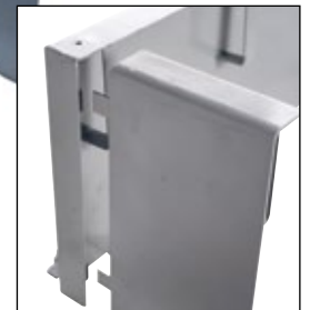
Optional Dock Bumper Mounting Plate