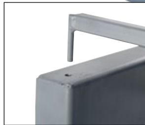
Front Squaring Support Member