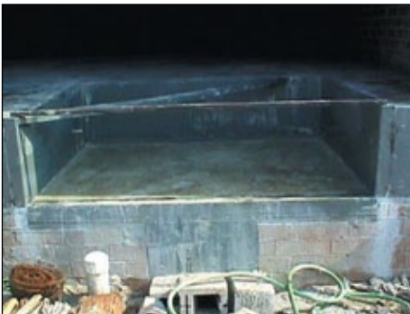
Pour around Dok-Box.