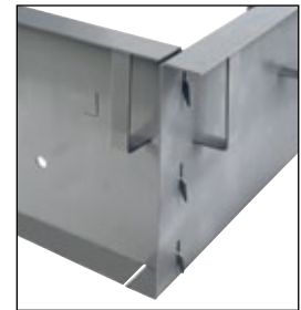
Quick-Hook™ Fastening System