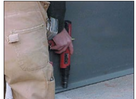
Anchor to pit floor - Helps assure squareness.