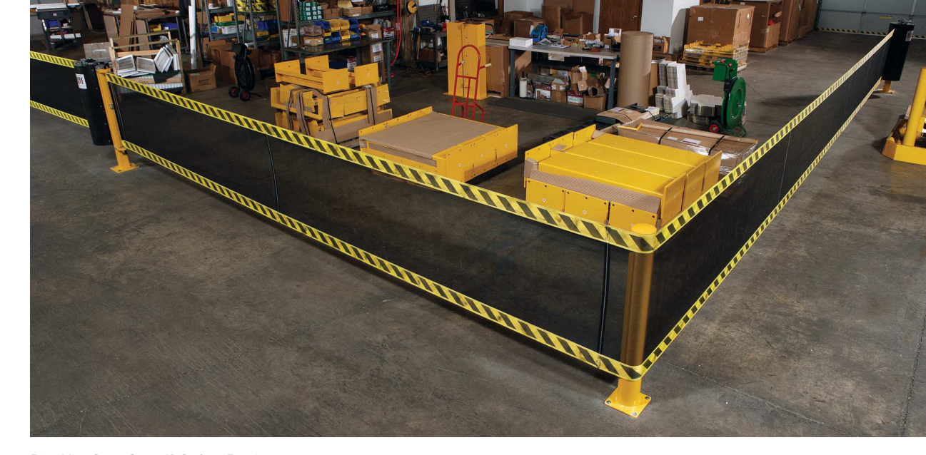
Rite-Hite SpanGuard® Safety Barrier

In heavy equipment operation zones, safety barriers also are frequently used (and for good reason). The barriers used in these applications are designed to absorb the energy of a vehicle impact, protecting plant personnel from potentially life-threatening injuries. Barriers are often applied at the edge of loading docks to protect pedestrians from accidentally stepping off, as well as forklift and other vehicle operators from inadvertently rolling over the edge. Safety barriers can also be applied to protect sensitive equipment or structural elements in a facility, saving repair costs and downtime.