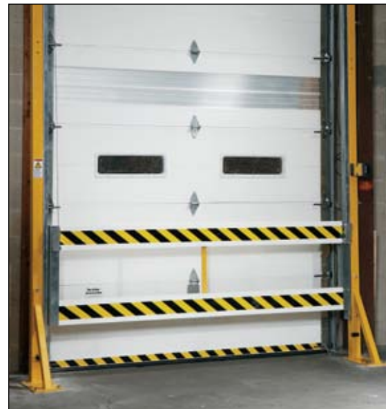
Light Duty Model